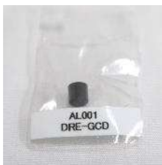
Fig.2 Label of serial code

This product can be used with 4 mm diameter disc electrode of DRE disc replaceable electrode.