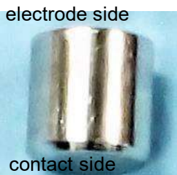
(2) 013367 DRE-PTD PT disk / 1pc Dia 4 mm disk electrode. Please pay attention the direction of disk electrode at assembly. We cannot warrant the electrode surface refresh if the chemical or physical modification was carried out.