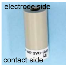
(1) 013361 DRE-DAS Disk assembly / 1pc The part for setting the disk and spacer.