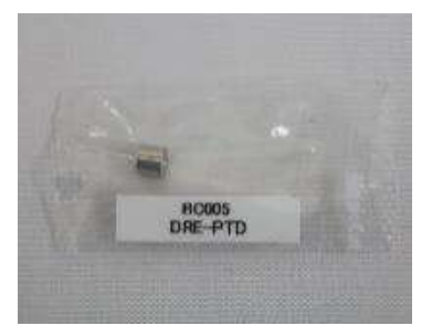
Fig.2 Label of serial code

This product can be used with 4 mm diameter disc electrode of DRE disc replaceable electrode.