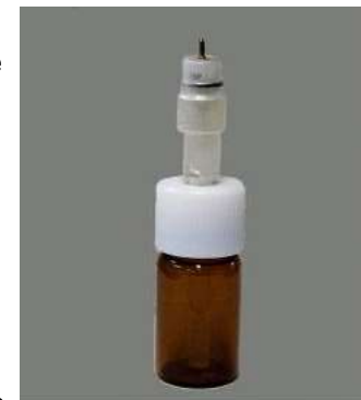
Keep in 012108 Preservative vial (option)

If don't use the electrode for long time, please seal the connect part between main body(a) and holder(c) with parafilm and soak in saturated KCl solution. If you have some mistakes on the electrode keeping, the electrode potential might be changed and the liquid junction might be broken.