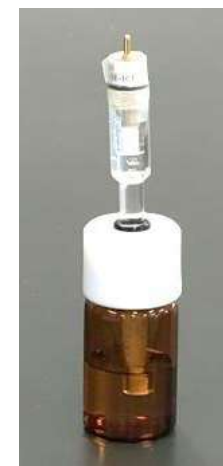
Keep in Preservative vial

The electrode potential cannot be maintained if kept in a solution with a different concentration or a solution of different ionic species from the internal solution. Incorrect storage may cause fluctuations in the electrode potential and breakage of the liquid junction.